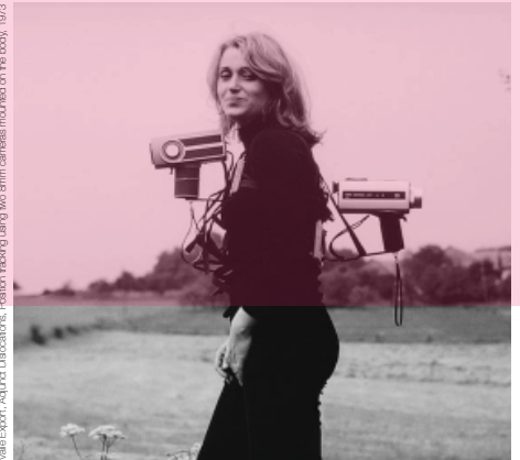
Vale Export, Aalborg Dislocators. Position tracking using two gimbal cameras mounted on the body, 1973

Materials required: Wide paper tape to secure mobile phones to the body (arms, torso, legs, head). Please bring suitable walking shoes and a mobile phone with internet connection.